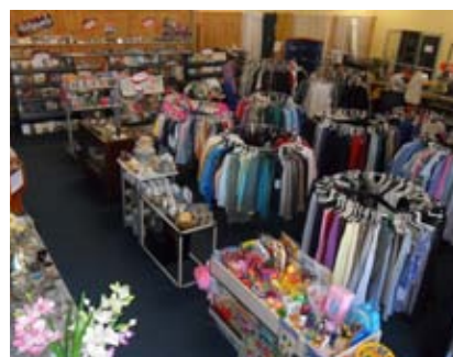
Inside the opportunity shop