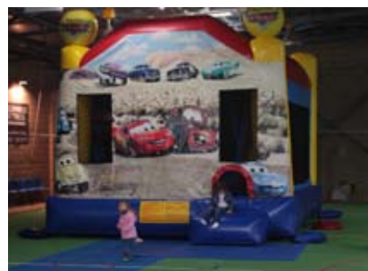
The face painting crew and the jumping castle were kept busy