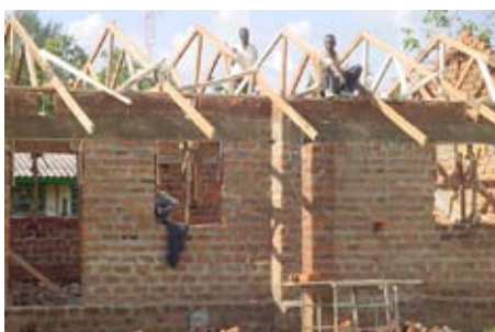
Constructing the laboratory