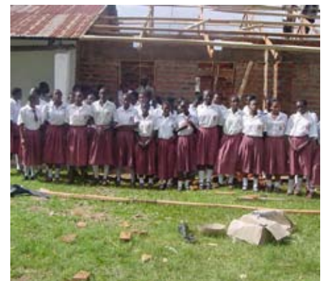
Students in front of the laboratory