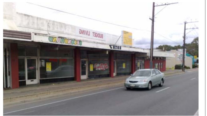
2009 Bethesda Christian Centre 1189- 1197 South Rd St Marys Adelaide South Australia