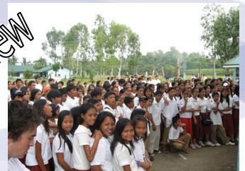
Philippines: Crusade in High School