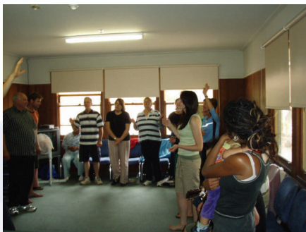
"Leaders from HOTR setting their hearts in worship at the Lady Northcote Camp"

The success of the weekend is a tribute to the intercessors from both churches who prayed. It is a joy to receive assistance from a stranger, but there is something especially precious when brethren set their hearts toward helping each other. In unity God commands the blessing (Ps 133).